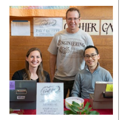
Parent volunteers working the Craft Fair Cafe.

of young kids, just like me. She loves to volunteer, and create and share that togetherness within a community, just like me, and at some point she found herself ready to take a plunge and just try , try to take on a big ask, like co-coordinating the Spring Fair event. Just committing to doing her best and seeing where the ride would take her. All of these thoughts, these memories, and even realizations flooded to mind when I saw this picture